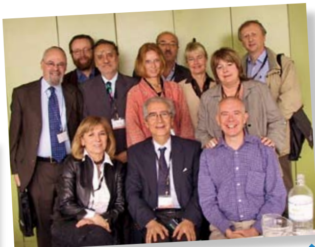
▶ The EFS Executive Comitee.

The Scientific Committee awarded prizes to the three most significant research contributions presented at the Congress and the Local Committee gave recognition to the best work carried out by Italian researchers. The Congress concluded with a reminder of the next important appointments at Goteborg (Sweden) in 2009 for the 19 th Congress of the WAS and Porto (Portugal) in 2010 for the 10 th EFS Congress. ●