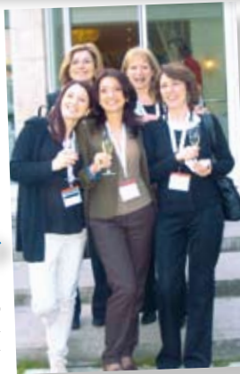
▶ The team of the Istituto di sessuologia clinica

The Congress also hosted numerous symposia organized in cooperation with various national and international scientific groups including the ISSC (International Society for Sexuality and Cancer), the FISS (Italian Federation of Scientific Sexology), the ONIG (National Observatory of Gender Identity), the SIA (Italian Andrology Society), the ISS (National Institute of Health), and a master lecture of ESSM (European Society of Sexual Medicine).